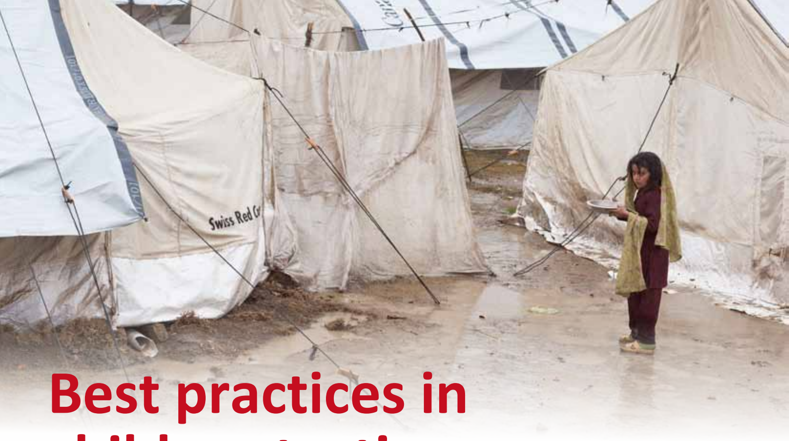
A young girl stands in the rain at a Red Cross Red Crescent camp in Charsadda, Pakistan. The camp houses 150 families left homeless by the monsoon floods in July 2010 and offers shelter, food, health care and a child friendly space.